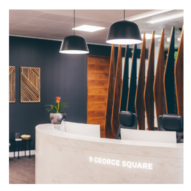
SPACE TO GROW YOUR BUSINESS.