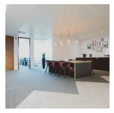
SPACE TO GROW YOUR BUSINESS.