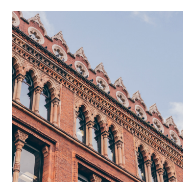
SPACE TO GROW YOUR BUSINESS.