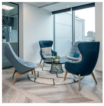
SPACE TO GROW YOUR BUSINESS.